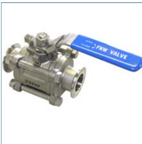
Figure 330CE SANITARY 3 PC FULL PORT 1000 WOG SS BALL VALVE