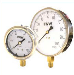
Gauges LIQUID FILLED & MECHANICAL CONTRACTOR'S PRESSURE GAUGES