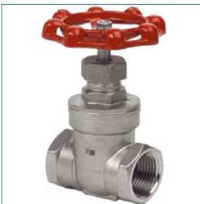
Figure 15B-200 THREADED SS 200 WOG NON-RISING STEM GATE VALVE