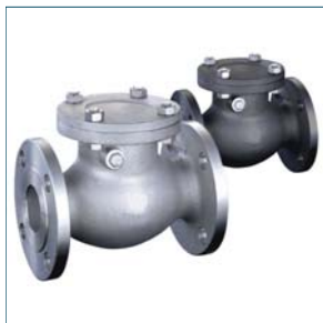
Figure 471 / 472 - SS Figure 571 / 572 - CS FLANGED SWING CHECK VALVE