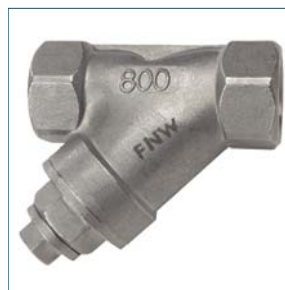
Figure 14B-YSS THREADED SS 800 PSI CWP Y-STRAINER