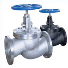
Figure 461 / 462 - SS Figure 561 / 562 - CS FLANGED GLOBE VALVE