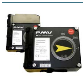
Actuation & Accessories VALVE POSITIONERS