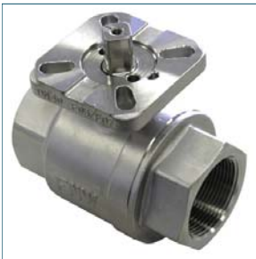
Figure 220M 2 PC FULL PORT 2000 WOG ISO MOUNT SS BALL VALVE