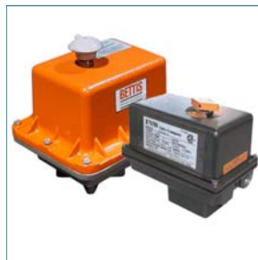
Actuation & Accessories ELECTRIC VALVE ACTUATORS