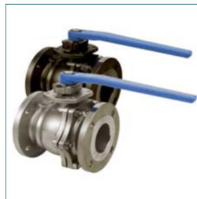
Figure 600 - SSxSS Figure 601 - CSxSS 2 PC FULL PORT 150# FLANGED BALL VALVE