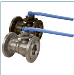
Figure 500 - SSxSS Figure 501 - CSxSS 1 PC STANDARD PORT 150# FLANGED BALL VALVE