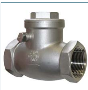
Figure 16B-200 THREADED SS 200 WOG SWING CHECK VALVE