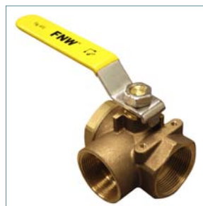
Figure 413 3-WAY DIVERTER 400 WOG BRASS BALL VALVE