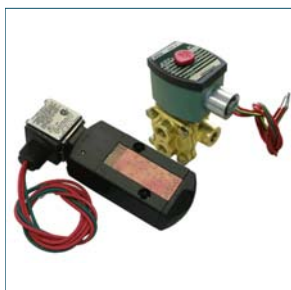
Actuation & Accessories SOLENOID PILOT VALVES