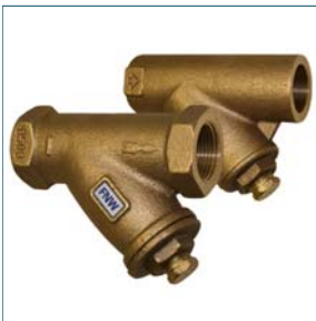
Figure 509 / 510 BRONZE Y-STRAINER