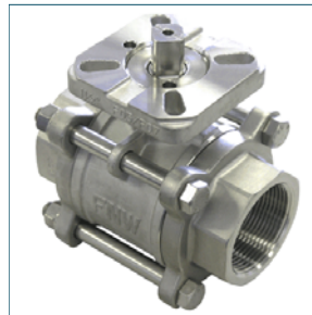
Figure 310M 3 PC FULL PORT 1000 WOG ISO MOUNT SS BALL VALVE