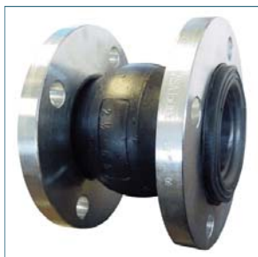
Figure 40 SINGLE SPHERE FLEXIBLE CONNECTOR