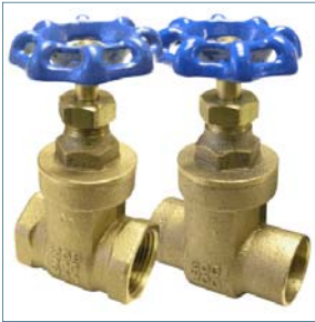
Figure 1211 / 1212 NON-RISING STEM 125# BRONZE GATE VALVE