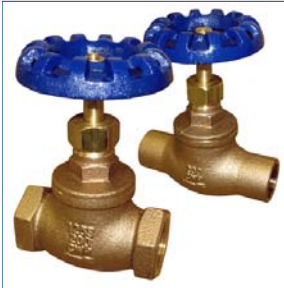
Figure 1231 / 1232 125# BRONZE GLOBE VALVE