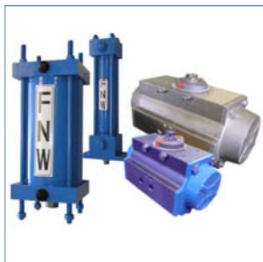
Actuation & Accessories PNEUMATIC ACTUATORS