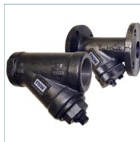
Figure 558 / 559 CAST IRON Y-STRAINER