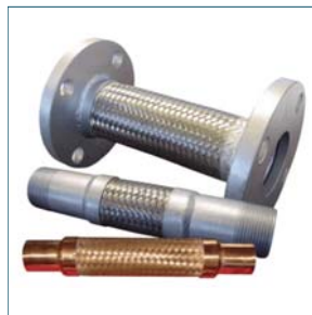
Figure 30F / 30T / 35S BRAIDED METAL ANNULAR FLEXIBLE CONNECTORS