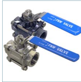
Figure 310 - SSxSS Figure 311 - CSxSS 3 PC FULL PORT 1000 WOG BALL VALVE