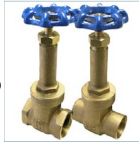
Figure 1221 / 1222 RISING STEM 125# BRONZE GATE VALVE