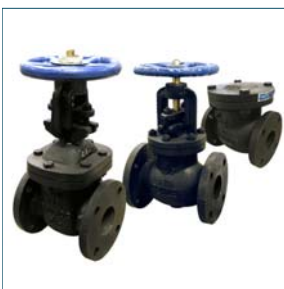
Figure 651 / 661 / 671 125# IRON BODY, BRONZE MOUNTED VALVE