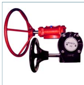
Actuation & Accessories MANUAL GEAR OPERATORS