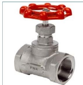
Figure 17B-200 THREADED SS 200 WOG GLOBE VALVE