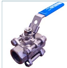
Figure 360 3 PC ECONOMY 1000 WOG STAINLESS STEEL BALL VALVE