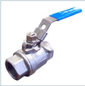
Figure 260 2 PC ECONOMY 1000 WOG STAINLESS STEEL BALL VALVE