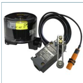
Actuation & Accessories POSITION / LIMIT SWITCHES