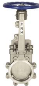
Figure 65B CAST SS KNIFE GATE VALVE, METAL SEATED