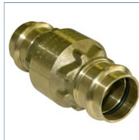
Figure 431 200 PSI PRESS CONNECTION BRASS IN-LINE CHECK VALVE FOR WATER