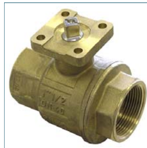
Figure 440 2 PC FULL PORT 600 WOG ISO MOUNT BRASS BALL VALVE