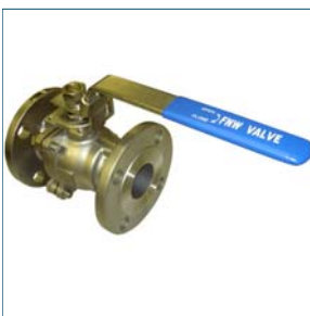
Figure 660 2 PC FULL PORT 150# FLANGED ECONOMY BALL VALVE