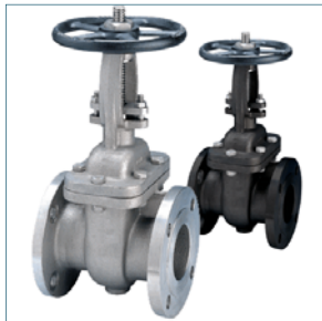
Figure 451 / 452 - SS Figure 551 / 552 - CS FLANGED OS&Y WEDGE GATE VALVE