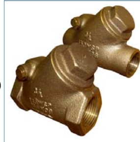
Figure 1241 / 1242 150# Y-PATTERN BRONZE SWING CHECK VALVE