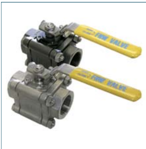
Figure 320 / 320C - SSxSS Figure 321 / 321C - CSxSS 3 PC FULL PORT 2000 WOG BALL VALVE